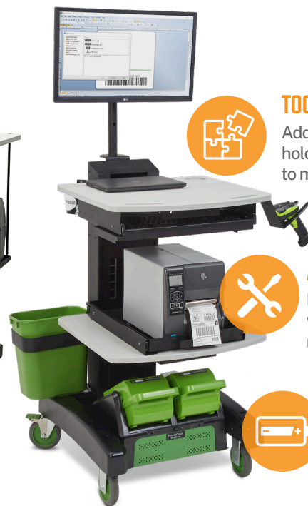
SHOWN: MID-RANGE NB SERIES CART WITH NUCLEUS LITHIUM POWER SYSTEM