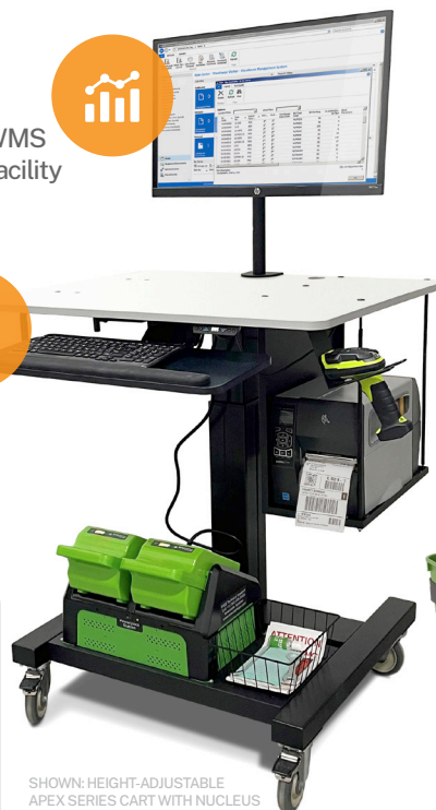
SHOWN: HEIGHT-ADJUSTABLE APEX SERIES CART WITH NUCLEUS LITHIUM POWER SYSTEM

Newcastle Systems Mobile Powered Carts are the affordable solution to streamline your operations, improve accuracy, and enhance employee satisfaction. Contact us today!