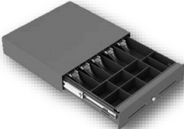
E3000 & SL3000