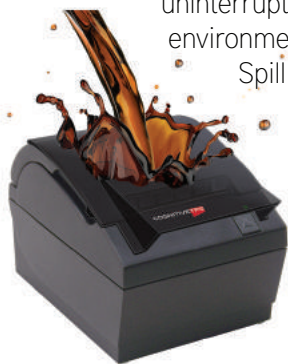
A798II with Spill Guard Accessory

The A798II was designed to withstand conditions in normal retail and hospitality environments where damage can occur. Designed with a liquid dam and unique drainage features, the A798II offers uninterrupted printing. For harsher environments, we also offer an optional Spill Guard accessory.